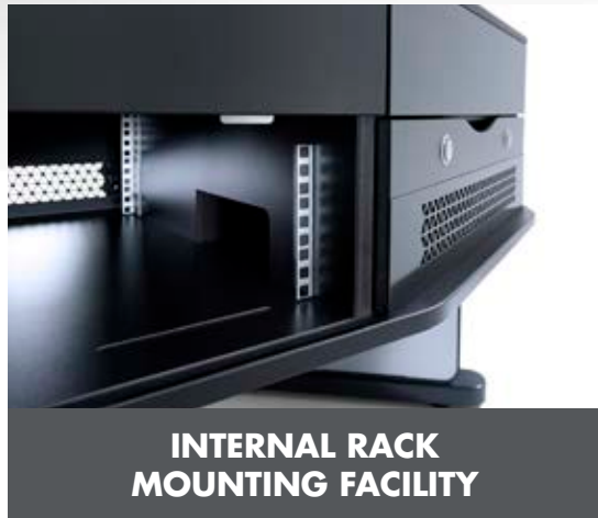
INTERNAL RACK MOUNTING FACILITY