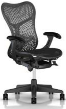
MIRRA II CHAIR