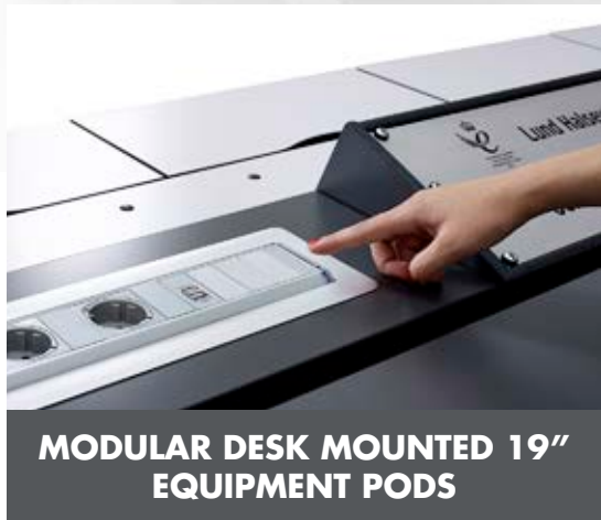
MODULAR DESK MOUNTED 19" EQUIPMENT PODS