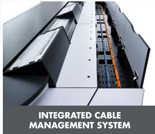
INTEGRATED CABLE MANAGEMENT SYSTEM